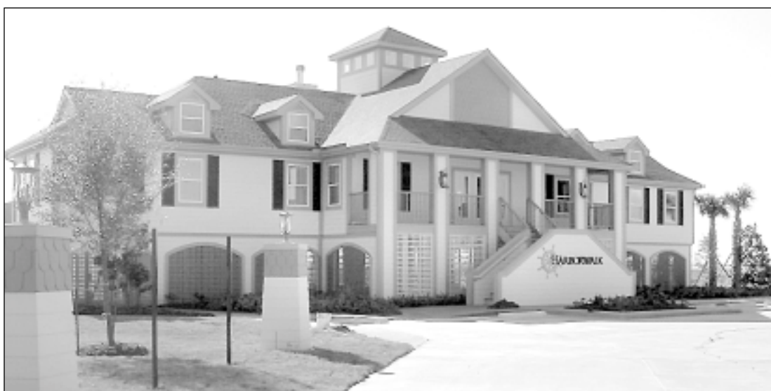
Located on the master-planned community's property near the guard gate at the intersection of Harbor Drive and Harborwalk Blvd., Harborwalk's new 4,400 square-foot Sales and Information Center provides visitors to the exclusive waterfront community an up-close look at the development on West Galveston Bay.

Profiles of Harborwalk's featured builders also are